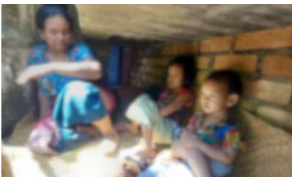
November 23, 2022

HURFOM: On November 21, 2022, the Karen National Liberation Army (KNLA) and the People’s Defense Forces (PDF) attacked the Taung Kalay Police Station in Taung Kalay village, located in Kyaikmayaw Township, Mon State.