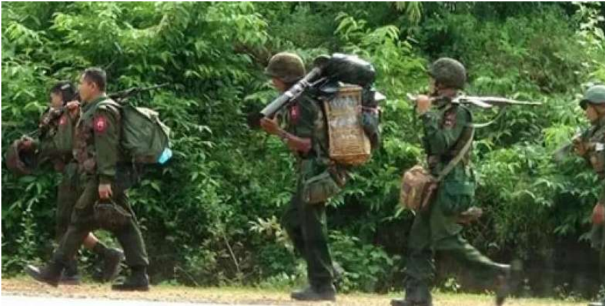
November 21, 2022

HURFOM: On November 15, 2022, there was a major armed clash between the Burmese military and the combined units of the Karen National Liberation Army (KNLA) and the People’s Defense Force (PDF) near Lut Shan village, Kyarinnseiky Township, Karen State.